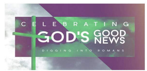
"Crawling, Walking and Running" Romans 8:18-29