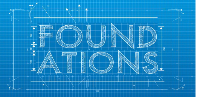
This Week: To the Least of These Exodus 20.13, Psalm 139