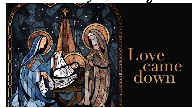
This Week: In the Struggle

Next Week: Come As You Are! 10:15 Cookies & Cocoa 10:35 Worship