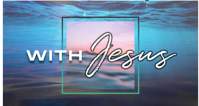
This Week: Humility, Obedience, Justice Isaiah 1.10-17, 66.1-5 Next Week: Truly Human