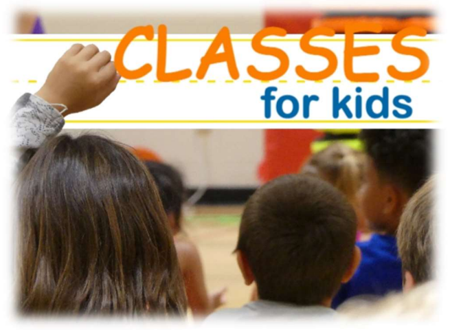
Great things go on in our Children's classes on Sunday AM and Wednesday PM. Come and see!